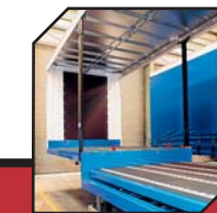
TAILORED FLOOR OPTIONS These include Rolladeck for easy pallet loading