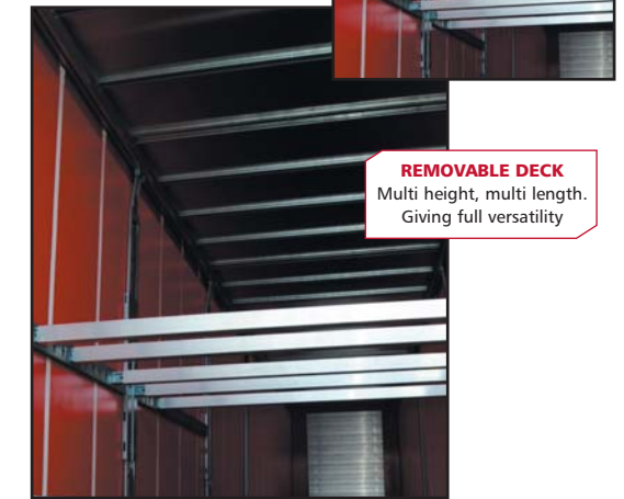
REMOVABLE DECK Multi height, multi length. Giving full versatility