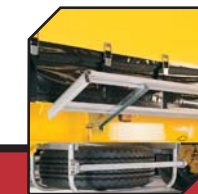
SPARE WHEEL CARRIER SDC standard fully galvanised security double or single wheel carrier can be bolted into position forward or behind axle bogie

"All in all, no other company is better equipped to deliver the right curtainsider solution for you."