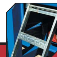
FOLDAWAY STEP LADDER Enables easy access to the trailer for the operator