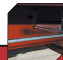
DOOR RETAINERS Wire-rope, chain or spring loaded options available