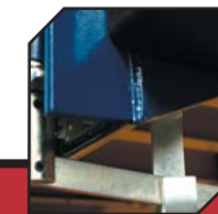
REAR TENSIONER Rear ratchet available in place of over centre standard fitting