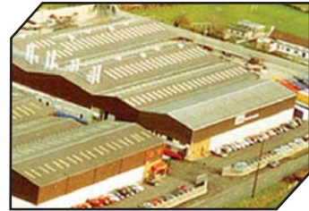
SDC Trailers LTD, Toomebridge, Co. Antrim