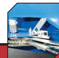
FLUSH FITTING FRONT RATCHET ASSEMBLY Incorporated into standard wrap-around continental bulkhead