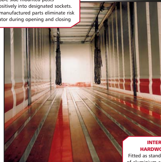
INTERLOCKED HARDWOOD FLOOR Fitted as standard with a variety of aluminium and steel in-lay and overlay options