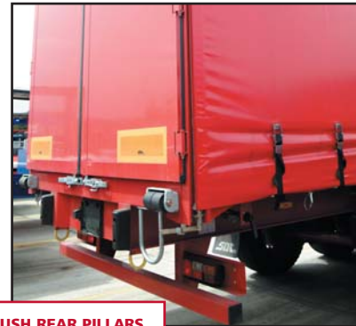
FLUSH REAR PILLARS Maximise hinge protection