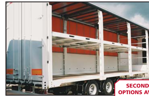
SECOND DECK OPTIONS AVAILABLE In ratchet, fixed removable format

All of our trailers are built to comply with EEC and UK construction and use regulations.