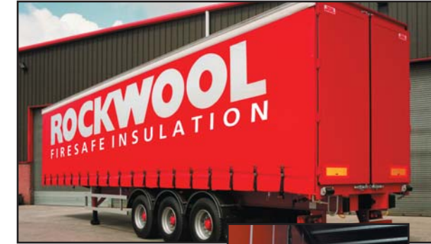
2 X 2 WEAVE CURTAIN Ensures secure load restraint and quality finish

Designed to meet current GCW legislation, operators can choose from 75mm, 100mm, 158mm and 206mm neck options and a weight range from 7,100kgs (Euroliner) and 6500kgs (standard) to 5,900kgs (lightweight). Trailer flooring is laid in conjunction with SDC's side rail construction which ensures no water ingress and is rebated onto the 'I' beam.