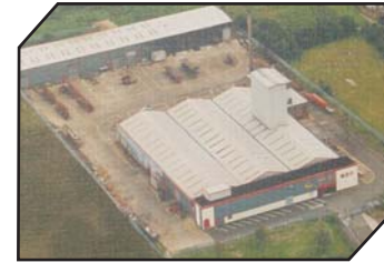
MDF Engineering, Antrim

Established in 1978, in Toomebridge, Northern Ireland, SDC began by manufacturing trailers and commercial vehicle bodies. Through the acquisition of Neville Charrold in 1994, a specialist tipping trailer manufacturer in Mansfield, Nottinghamshire, SDC expanded both its range of trailers as well as its production facilities onto the UK mainland.