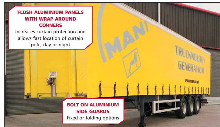
FLUSH ALUMINIUM PANELS WITH WRAP AROUND CORNERS Increases curtain protection and allows fast location of curtain pole, day or night