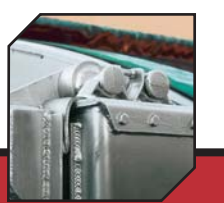
OPTIONAL DOUBLE ACTION OR RISING HINGES