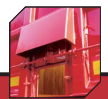
RACK & PINION HATCH