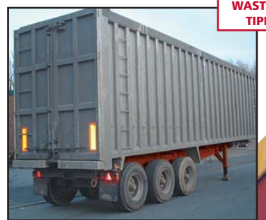
WASTE SPEC TIPPERS