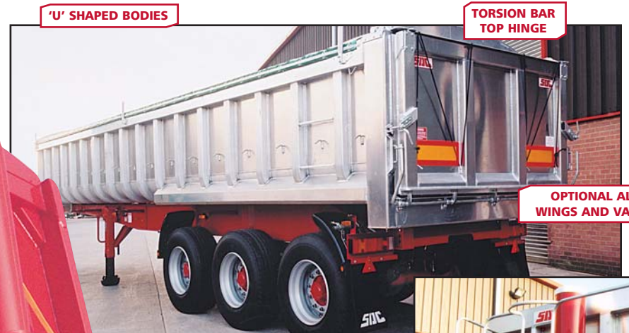
'U' SHAPED BODIES