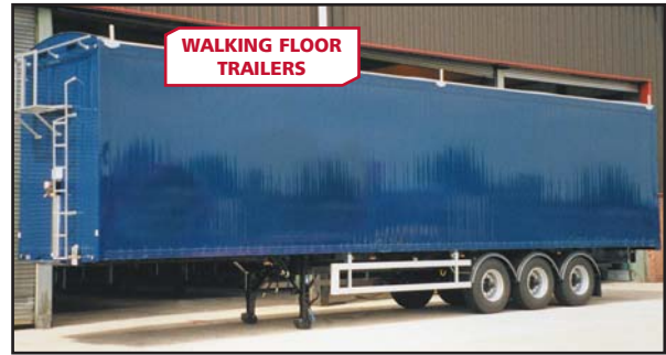
WALKING FLOOR TRAILERS