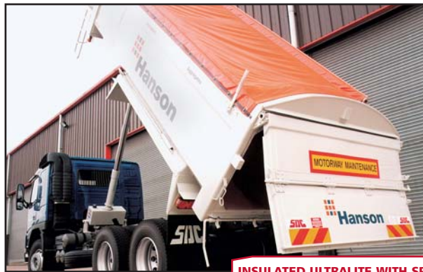
INSULATED ULTRALITE WITH SPLIT TAILGATE

All our tipping trailers are built to comply with EEC and UK construction and use regulations.