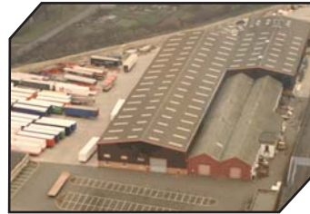
SDC Trailers LTD, Mansfield, England