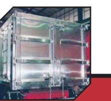
CHOICE OF REAR CLOSURES